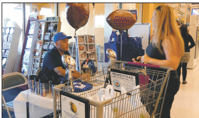
Sean Landeta meets fans and signs autographs in Levittown

SPECIAL SECTION INSIDE Real Estate Guide